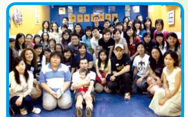
護苗義工於迎新活動中合照。 ECSAF volunteers at the orientation program.