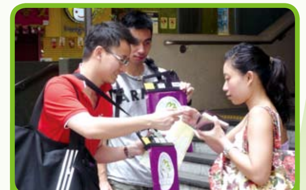
義工和市民齊心參與賣旗日，為「護苗基金」籌款。 Volunteers and citizens showed full support to ECSAF on the Flag Day.