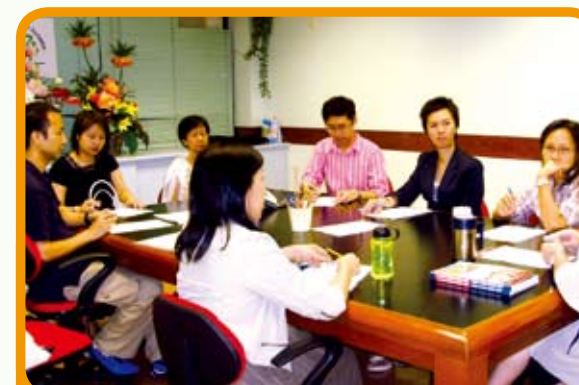
義工為籌備會議絞盡腦汁。 Volunteers participated in ECSAF meetings.