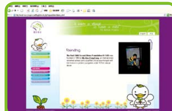
護苗網站全新面貌。 New ECSAF Website.