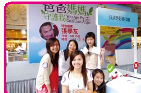
大家出盡法寶，把遊戲攤位搞得有聲有色。 Our volunteers have made the ECSAF Game Booth fantastic!