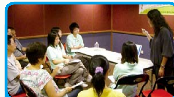
「護苗基金」將全面修訂現有講座內容。 ECSAF will carry out content revision on parents' talks.