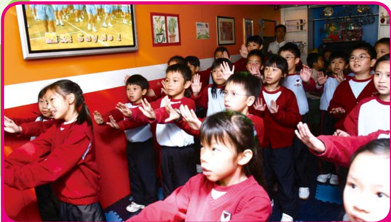
護苗課程自推出以來，廣受校長、老師及學生的讚賞。 The ECSAF Education Outreach Programs have gained great appreciation from school principals, teachers and students.