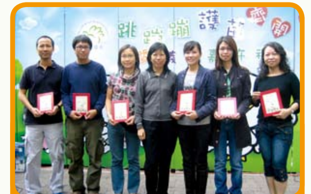
義工同心為「護苗基金」出力，於義工嘉許典禮留影。 Let us give a thumb-up to our volunteers!