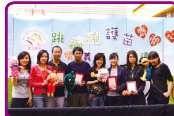
義工落力參與布偶劇演出，為小朋友帶來無窮歡笑。 The Puppet Show brought a lot of laughter to children.